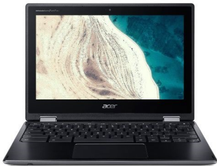
11" Acer Chromebook $564.80