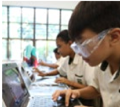
Support Self-Directed and Collaborative Learning