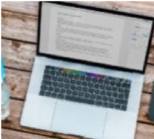
Support the Development of Digital Literacy

The use of the PLD for teaching and learning aims to: