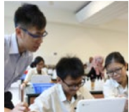
Enhance Teaching and Learning